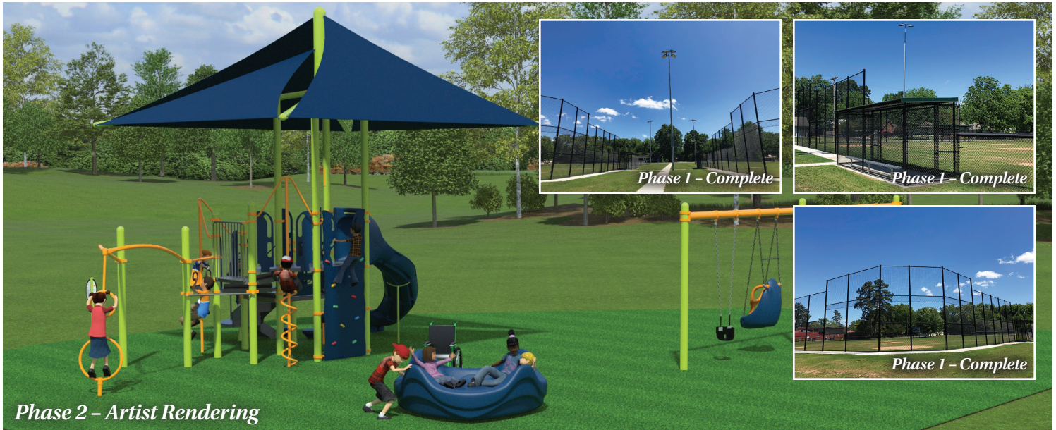
Phase 2 – Artist Rendering